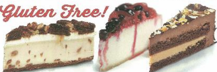
TURTLE CHEESECAKE • VERY BERRY CHEESECAKE • CHOCOLATE ALMOND TORTE